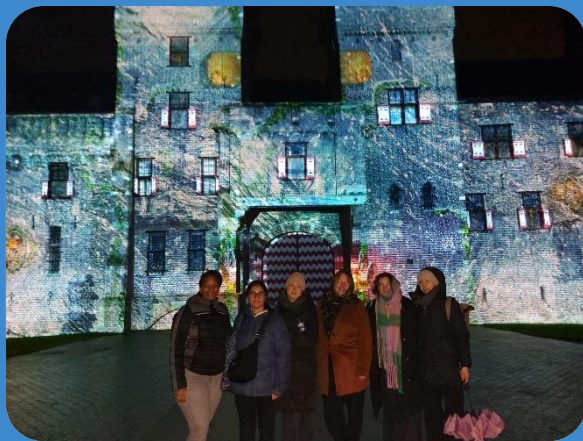
international class (2022-2023)

This course aims to foster urban teaching and develop the skills that are necessary to become an effective and productive urban teacher. It is important to learn how to live and work effectively in a diverse world and to be able to apply a broader perspective to the world around you in order to become more interculturally competent.